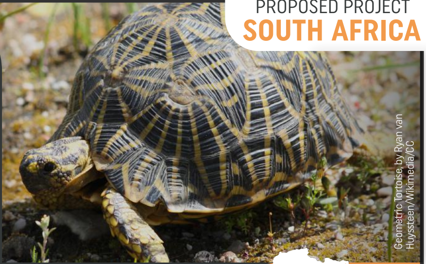
Geometric Tortoise