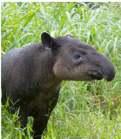
Baird's Tapir